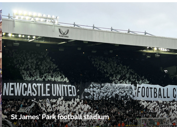
St James' Park football stadium