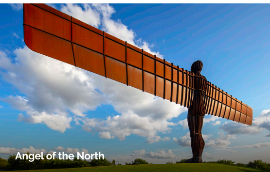
Angel of the North

Because our region borders Scotland there's even more to explore if your child wants to travel further.