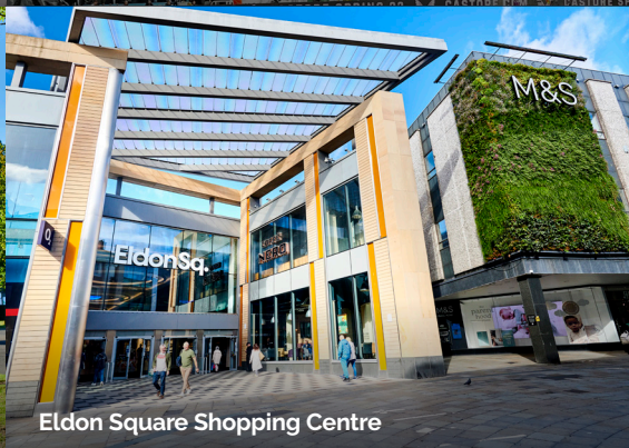
Eldon Square Shopping Centre